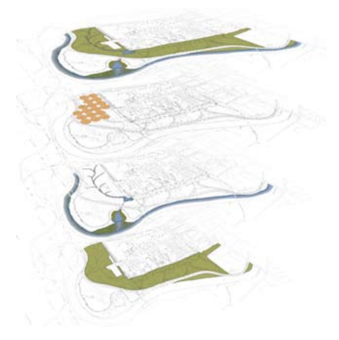
Figure 5: Layered plan of student project showing phytoremediation and stormwater treatment.

from rooftops to river was made visible (Figure 4). All downspouts within the housing development visibly emptied into open water channels that in turn ran into vegetated strips within the road network and provided irrigation. These in turn led to "eco-cells" at the perimeter of the built area that acted as gateways to the perimeter river system. These cells were wetland areas where the rise and fall of water level would be clearly visible. They also contained recreational functions and were interconnected by a system of recreational trails. In addition, the stormwater system moved water from one cell to another with each planted differently to