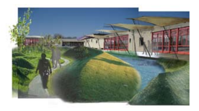
Figure 3: Vignette of recycling center run by transient residents adjacent to stormwater berm-swale system with recreation trails. (Source: Student drawing by Nathan Martin)

In addition to creating physical spaces for inhabitation and gathering, the container system also acted as a catalyst in creating a new kind of economic system designed to weave together the disparate site populations. Several containers on the ground level, for example, could be used as workshops run by homeless residents with practical skills such as auto and bicycle repair. Residents of the housing development would thus have easily accessible services nearby that would in turn provide income for the service providers. Other containers could be used to create recycling centers where both homeless and development residents could both bring and acquire materials, generating a system of exchange between different economic levels while simultaneously creating a common connection to resource conservation (Figure 3).