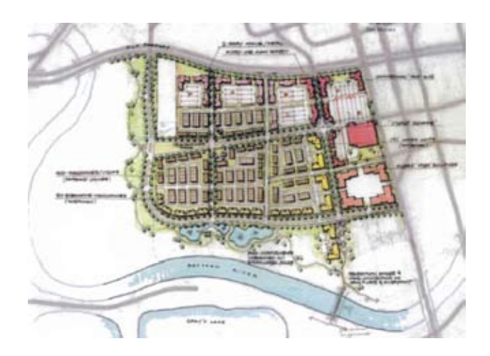
Figure 2: Proposed site development.

relatively undefined environmental and recreational enhancements (Figure 2).<sup>2</sup>